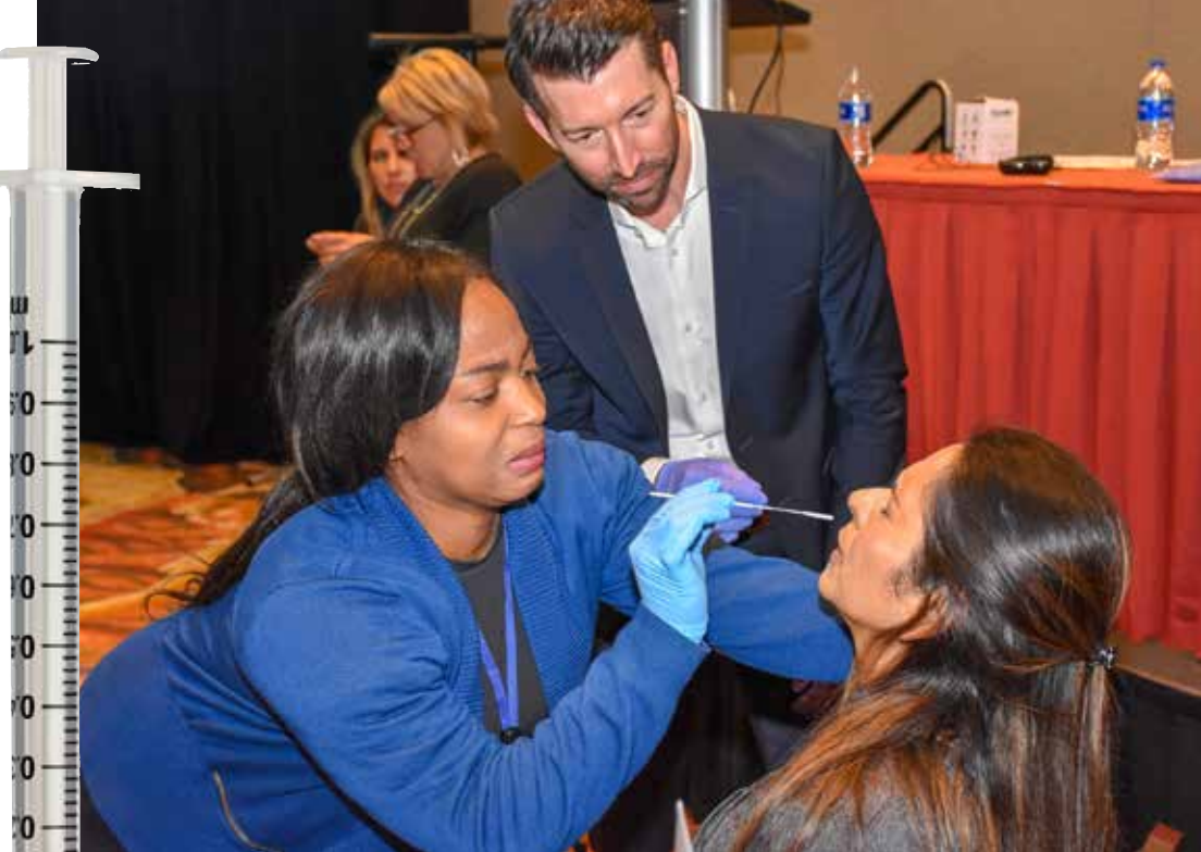
▲ Educating pharmacists at APhA2022's Test and Treat session.

Webinar Series covers the latest information and intends to help pharmacists increase access to equitable care during the public health emergency. Health equity and addressing SDOH were the specific focus of the following webinars: