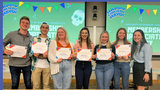
University of Missouri – Kansas City APhA-ASP Recipients of the 2021-2022 Policy and Advocacy Literacy Certificate, presented at Membership Appreciation Day on May 6, 2022.

Additional opportunities for points in the future: • Letter writing campaign • Leadership roles, i.e. serving as Chapter Delegate at the House of Representatives Session • Holding a regional or national leadership position